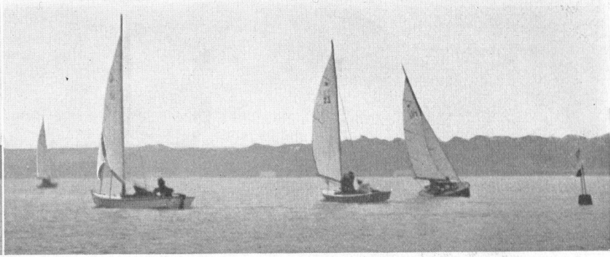
Starting the run home, Fort Worth leading (No. 23)