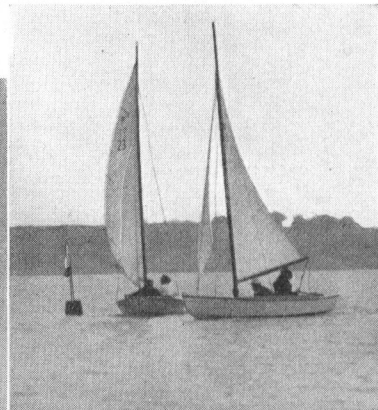
Fort Worth cuts inside Dallas at the buoy. Trophies offered for State and Lake championships for both men and women