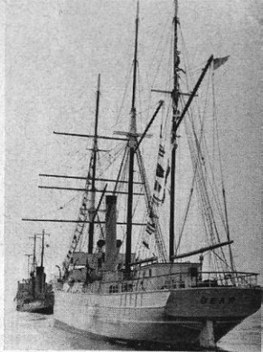
W. Hugh Conrod

THE "stoutest ship ever built", the Bear , gave her final growl some time after 9.10 p.m. on March 19 off the southern tip of Nova Scotia. As darkness fell over the 90-year old veteran of the seas, 35-ft. waves were battering her hull, a hull that had withstood the pressures of Antarctic waters.