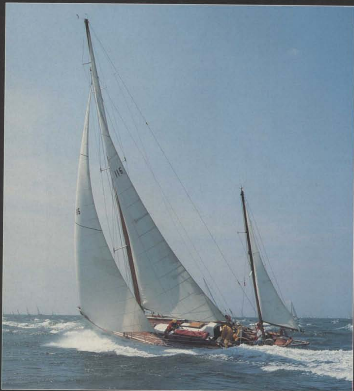
BEKEN OF GOWES

Right: Note here the changes in the rigging from that used earlier. One running backstay, and a standing backstay has been added, with insulators to allow it to be used as a radio aerial. No reefs in the mizzen, and three reefing points in the main instead of two.